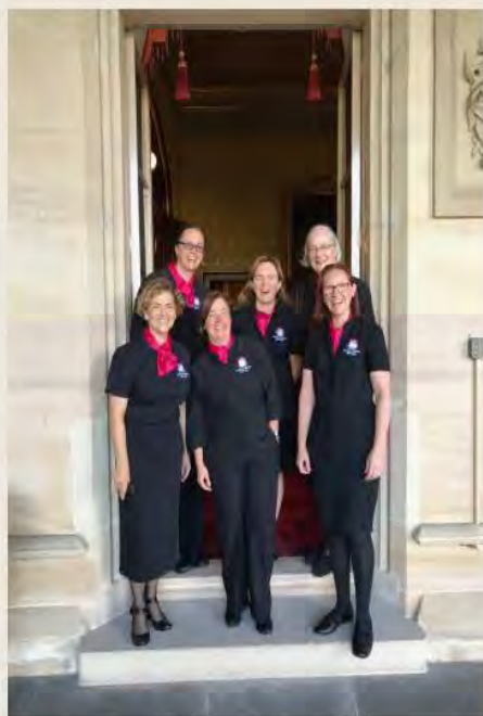
Centenarian's Celebrations, Government House, Sydney, April 2017