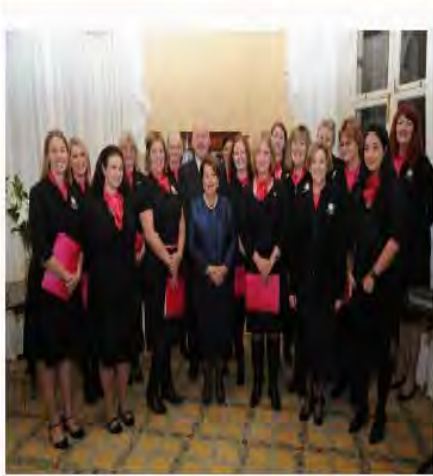
Partners of Veteran's Association reception, Admiralty House, Sydney, 2015